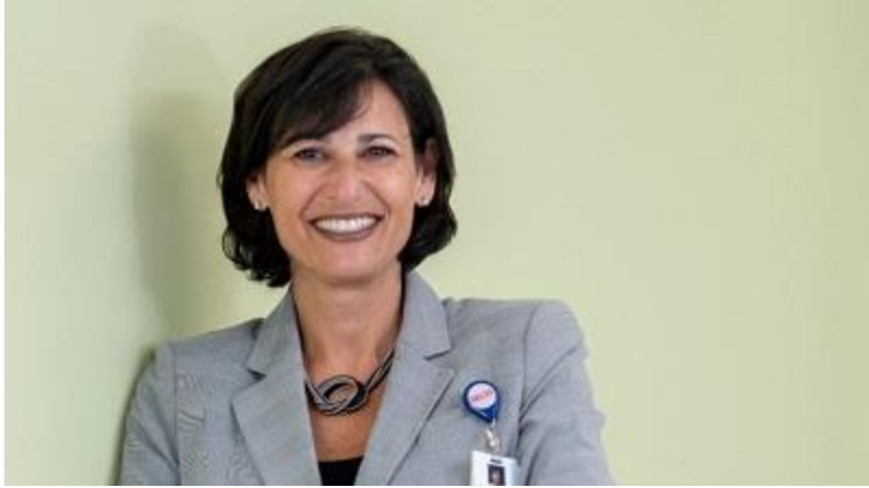
CDC Director Rochelle