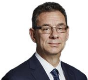
Pfizer Head of vaccines Albert Bourla dual citizenship with Israel