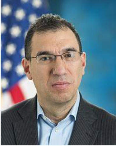
Covid senior advisor Andy Slavitt dual citizenship with Israel