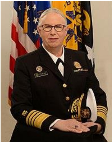
HHS Assistant of Health Secretary for Human Services Rachael Levine [Transgender] dual citizenship with Israel