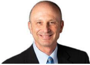
Pfizer chief scientist Mikael Dolsten dual citizenship with Israel