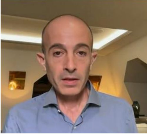
WEF Head Advisor of the World Economic Forum (WEF) Yuval Harari dual citizenship with Israel