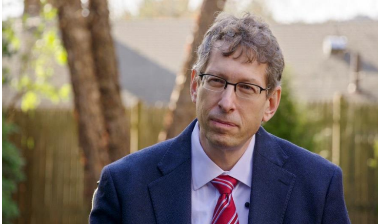
Tal Zaks dual citizenship with Israel